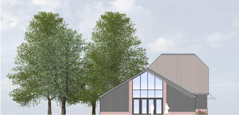
North Western Elevation